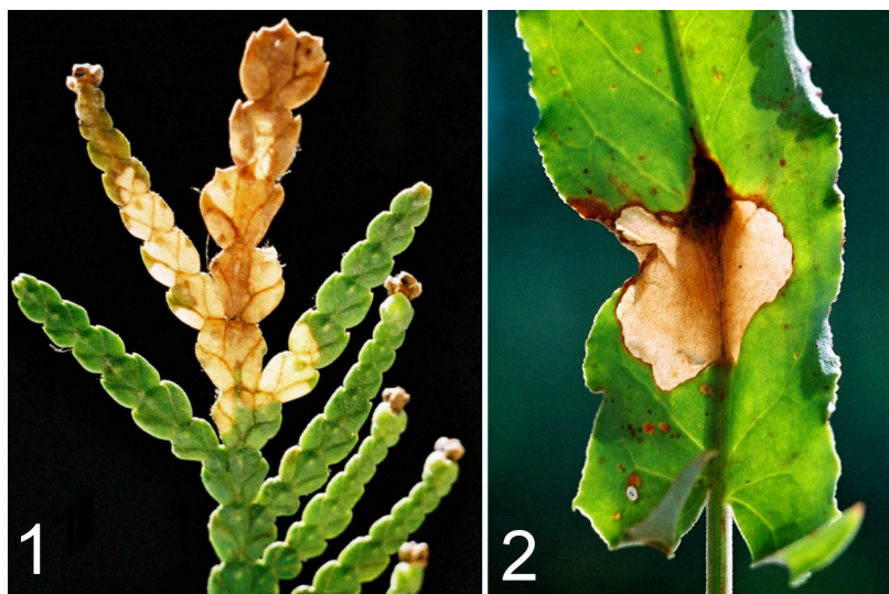
Figs 1-2. Larval mines. 1 – Argyresthia thuiella on Thuja occidentalis ; 2 – Monochroa sepicolella on Rumex thyrsiflorus .

This invasive micro-moth is originally a North American species that has been accidentally introduced to Western Europe in seventies of the 20 th century. At present, it is known from many countries of western, southern and central parts of Europe although its rate of spreading is rather slow, especially in comparison with rate of recent expansions of other moths in Europe, e.g. Phyllonorycter robiniella (CLEMENS, 1859) or Cameraria ohridella (DESCHKA & DIMIĆ, 1986); this fact may be, among others, a result of monovoltinism of Argyresthia thuiella . In Poland, it has recently been found for the first time in few sites in most western part of the country: Gubin, Kostrzyn, Siekierki, and Słubice (BARANIAK & WALCZAK 2004). Present data indicate that the species may have started to colonize the country by anemochore dispersal from two separate trails, i.e. from Germany in the west, as well as from Slovakia in the southeast.