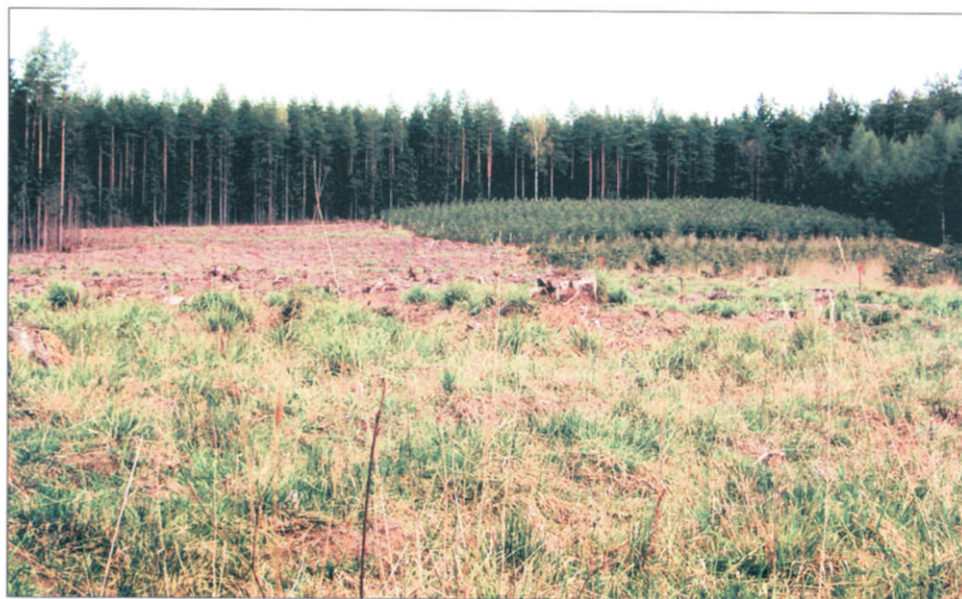
Fig. 3. Habitat of Scolia hirta in a forest clearing near the Bobrowa village, in the Knyszyn Forest Landscape Park.

The species is not protected by law in Poland. Currently it is recorded in steppe reserves (Folusz, Pamięcin, Biała Góra), in the Drawa National Park, and in the Knyszyn Forest Landscape Park (Fig. 3).