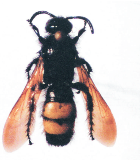
Fig. 1. Scolia hirta SCHRANK, 1781

WODZICZKO 1938), and in Lower Silesia, including Trzebnica Hills and the Eastern Sudetes (DITTRICH 1911, WIŚNIEWSKI 1994, BANASZAK 2004) (Table 1) (Fig. 2).