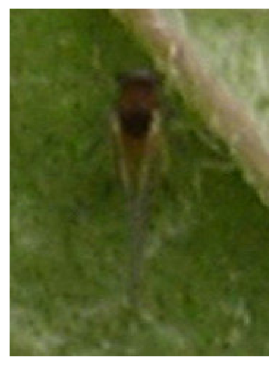
Fig. 3 Adult alate parthenogenetic morph. (Bar represents 2 mm).

between the last moult and beginning of reproduction ranges from 2 to 3.5 days during summer, 1 to 2.5