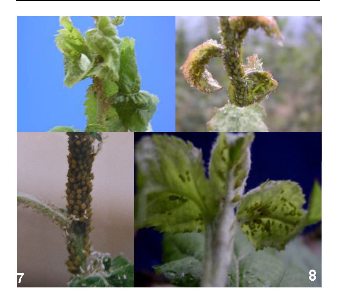
Figs 5-8. 1 – Build up of population of green apple aphid on apical parts of apple nursery plant, 2 – Severe infestation on twig of apple nursery plant, 3 – Heavy infestation of green apple aphid on twig of apple plant, 4 – Establishment of new infestation.

With infestation on the apical parts of the apple nursery plant, green apple aphid builds up population rapidly (Figs 5-8). The effect of feeding on the growth of nursery plants was measured in two sets of 10 plants each.