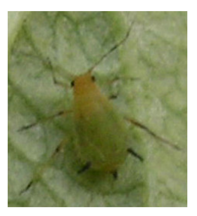
Fig. 1. Adult apterous parthenogenetic morph. (Bar represents 1.8 mm).

and beginning of reproduction ranges from 2 to 3 days during summer, 1 to 2 days during rainy, 1 to 2.5 days during autumn and 2 to 3.5 days during winter season (Table 2).