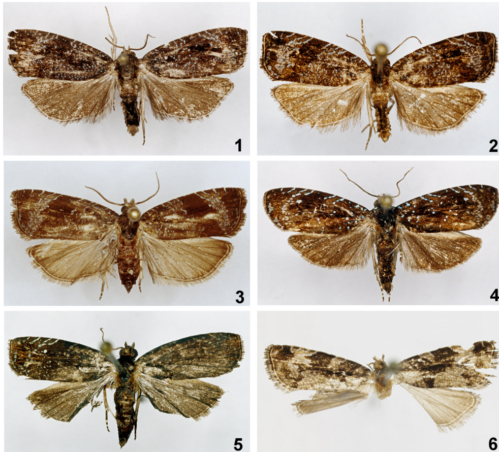
Figs 1-6. Adults of Parnathozela gen. n. 1 - P. zopheria sp. n., holotype; 2 - P. stilbia sp. n., holotype; 3 - P. spiloma sp. n., holotype; 4 - P. polyasterina sp. n., holotype; 5 - P. calamistrana sp. n., holotype; 6 - P. lobulina sp. n., holotype.